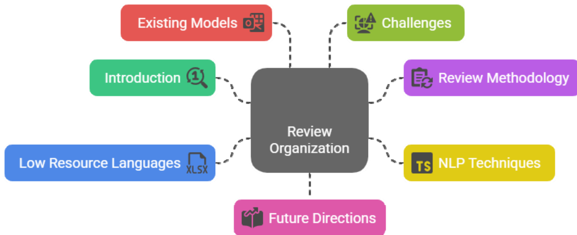
Fig. 1. Organization of the review.